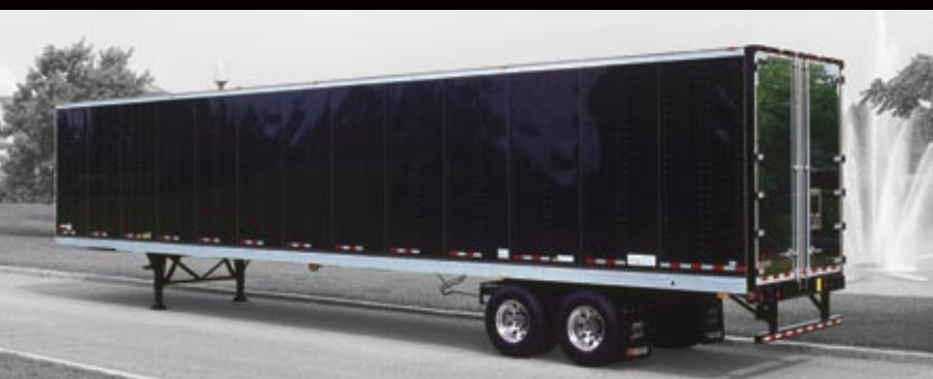
Tandem dry van