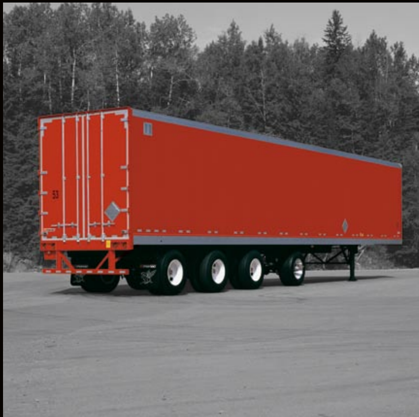
Quad-axle dry van