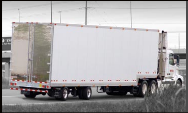
Drop deck dry van with 17" drop