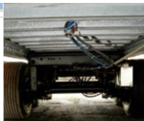
Galvanized steel crossmembers, tracks and bogie