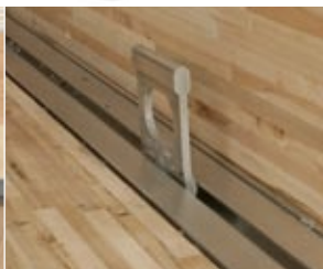
Floor-integrated securement track with multiposition cargo hands