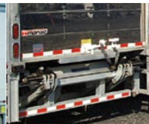
Door frame ready for installation of tailgates