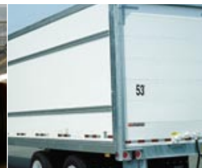
Galvanized steel door frame, roll-up door and rub rails