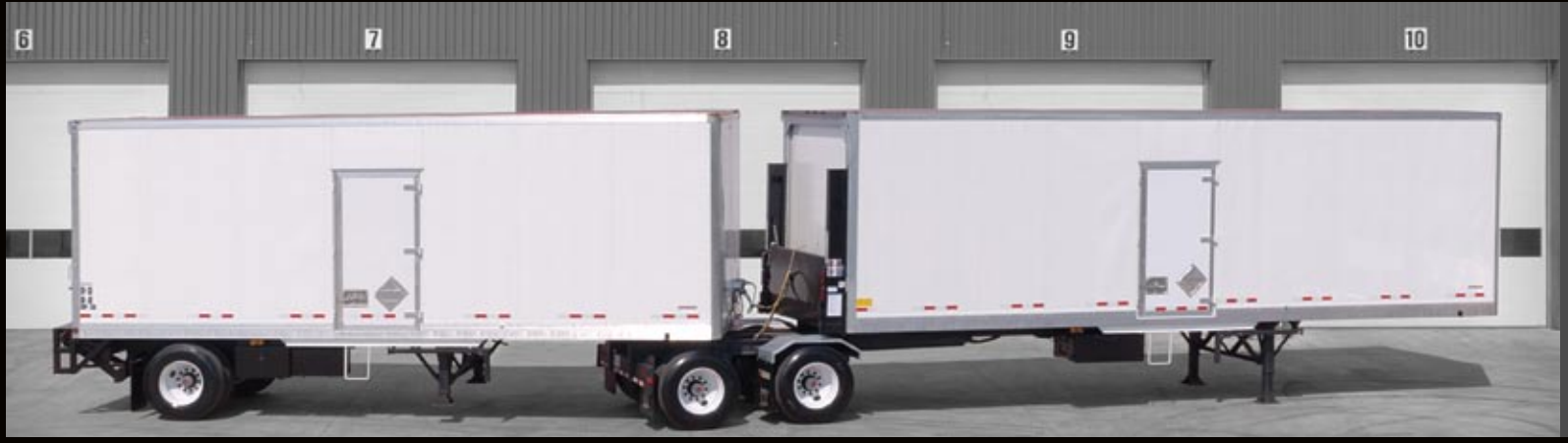
B-train dry van