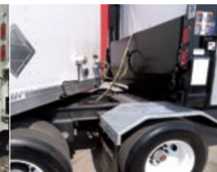
B-train combination, slide-away bogie