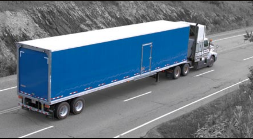
Tandem dry van with side door