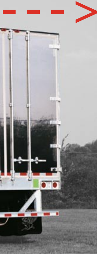
Eight-axle dry van (Michigan configuration)