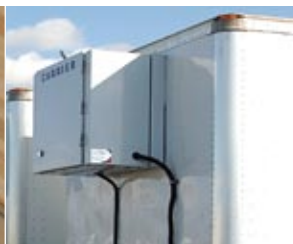
Insulation (heated vans)